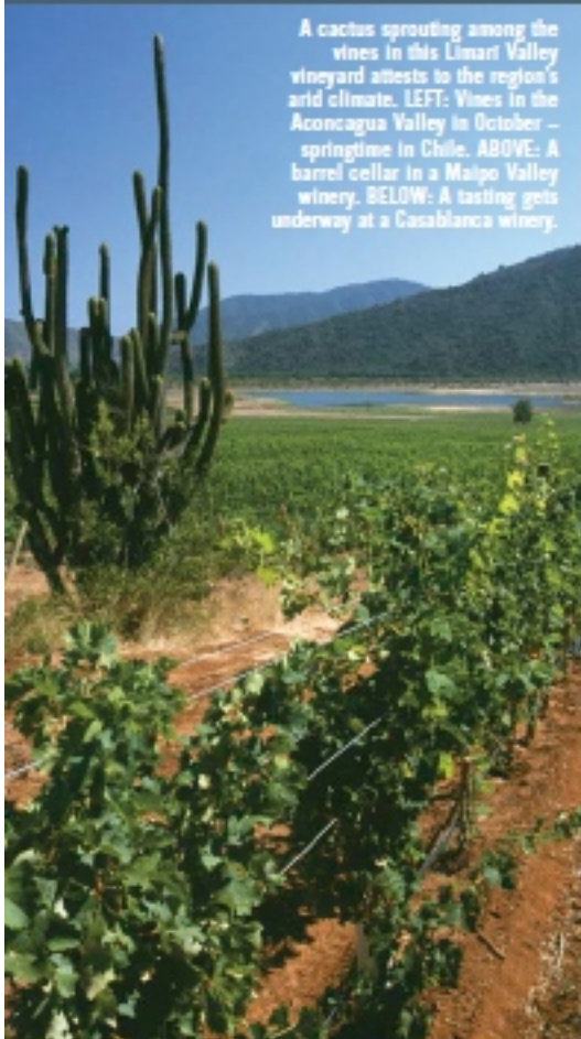
A cactus sprouting among the vines in this Limari Valley vineyard attests to the region's arid climate. LEFT: Vines in the Aconcagua Valley in October – springtime in Chile. ABOVE: A barrel cellar in a Maipo Valley winery. BELOW: A tasting gets underway at a Casablanca winery.